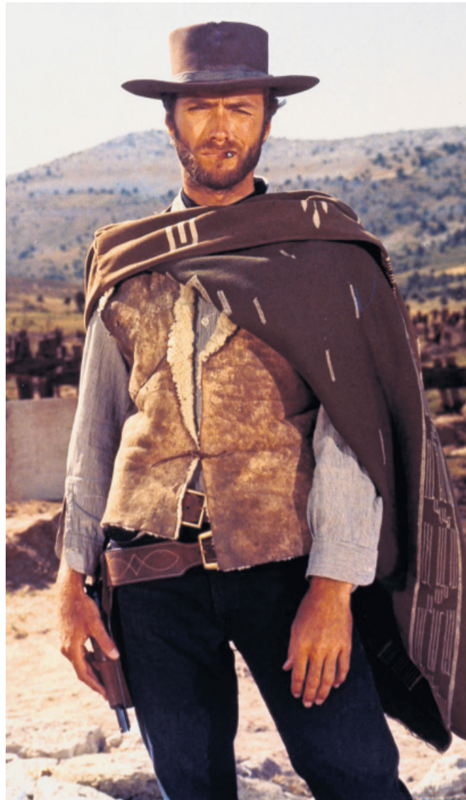
The Man with No Name Clint Eastwood is the hero of Sergio Leone's The Good, the Bad and the Ugly

There was even a revolution of sorts in genre filmmaking. Sergio Leone, who had made his name working on a series of sword and sandal epics, rewrote the conventions of a classic American genre with A Fistful of Dollars. It spawned the Spaghetti Western and was followed by For a Few Dollars More