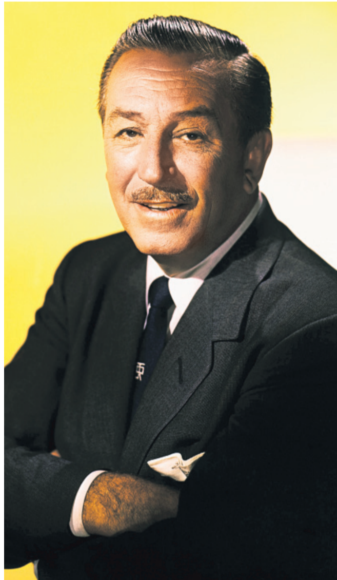
Happy birthday, Walt Disney To celebrate the creative ingenuity of the studio, Zlín will screen films from Disney's two golden ages.

From the 1970s through to the late 1980s, there was a creative drought at Disney. The animated films were often insipid, lacking the vigour of the earlier masterpieces. As a result, live action features began to dominate, such as Mary Poppins and Chitty Chitty Bang Bang. There was the odd animated film, such as Robin Hood (1973), featu-